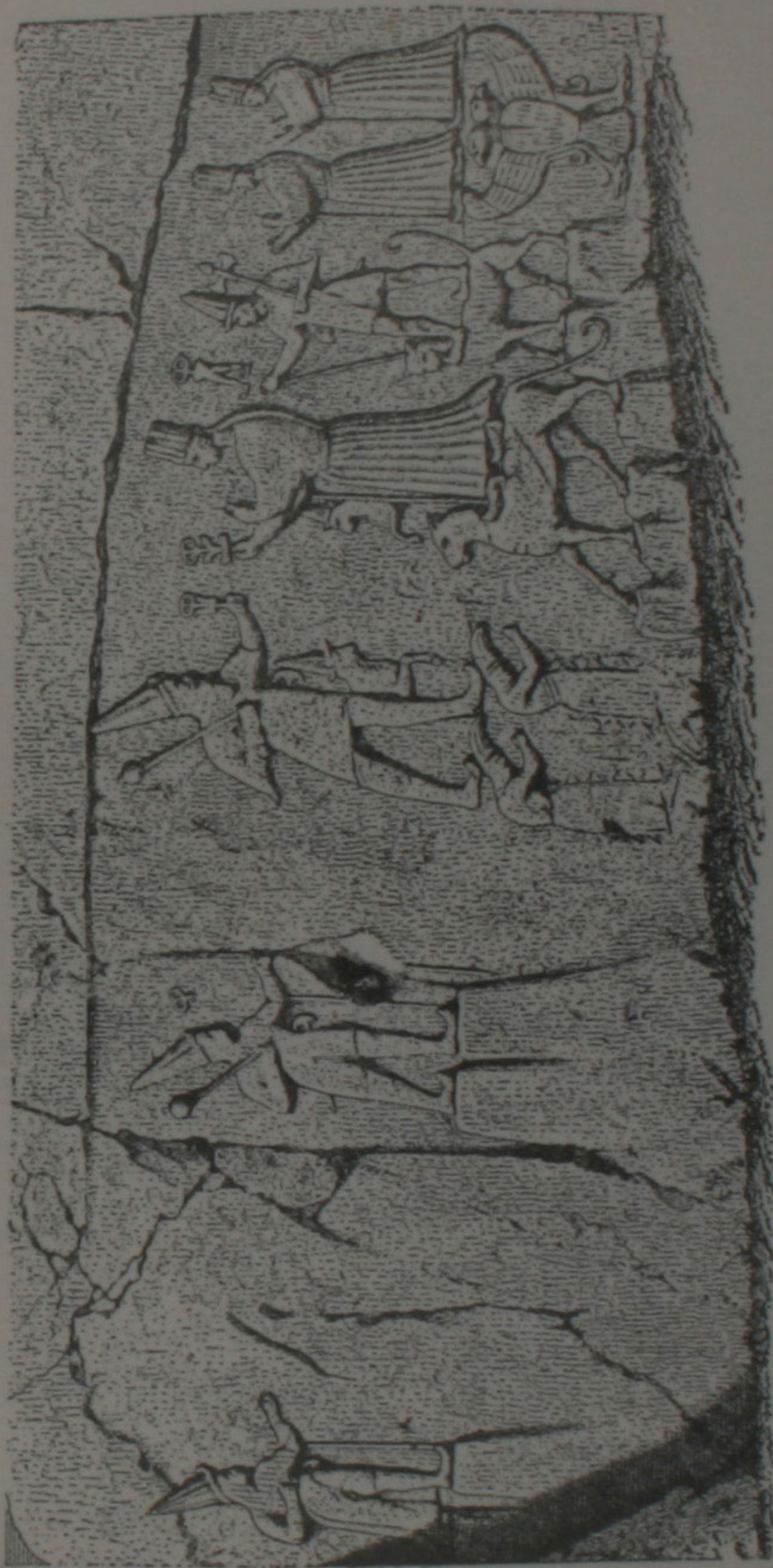
FIG. 7.—RELIGIOUS PROCESSION. From a rock wall near Boghazköi.