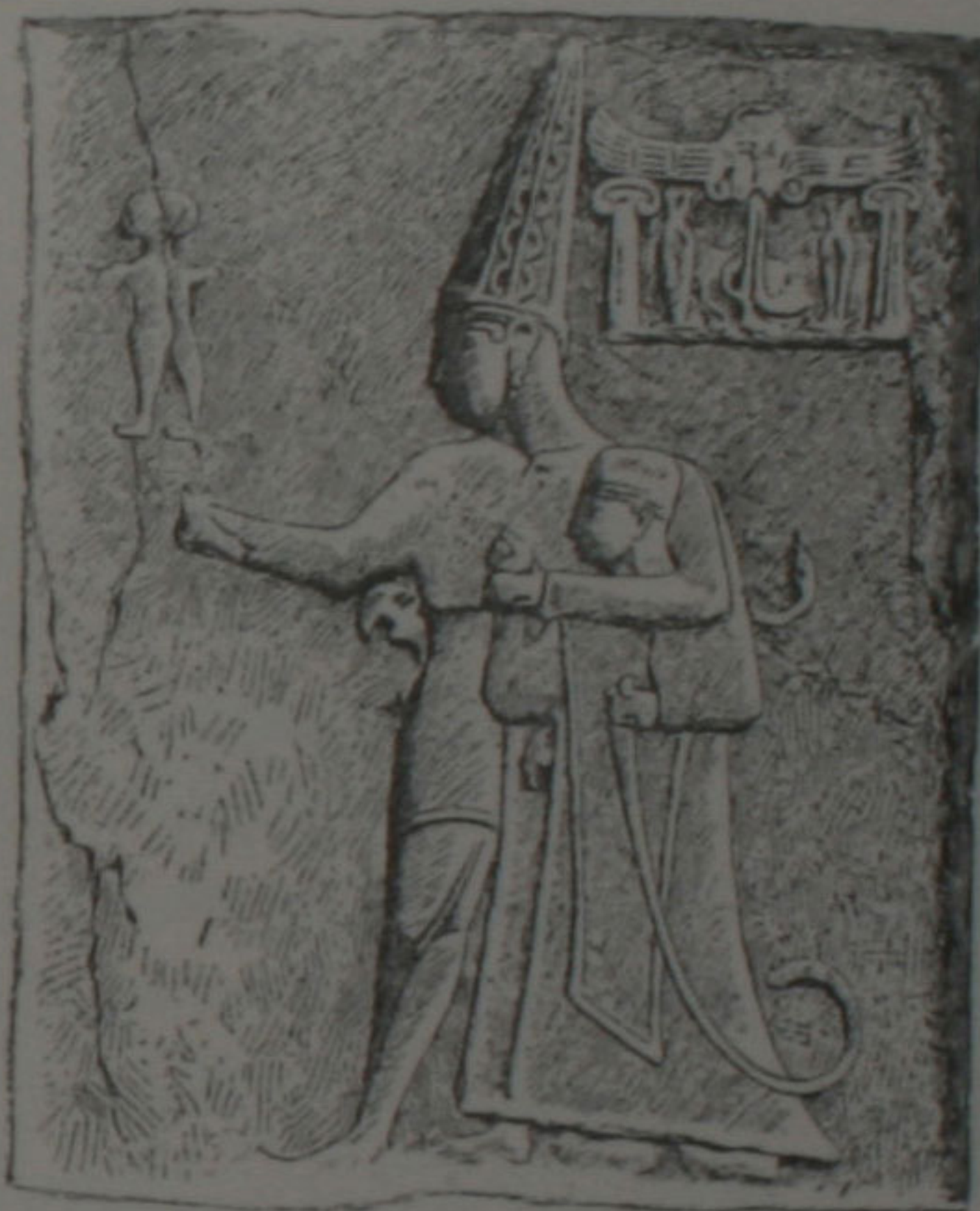
FIG. 8.—DEITY EMBRACING A KING OR PRIEST.

approximately the date of the Boghazköi sculptures. Some investigators have placed them so late as 700 B.C., but it seems reasonable to suppose that the only two instances as yet discovered of a very singular representation may possibly belong to the same epoch, and they may thus perhaps be assigned to about the