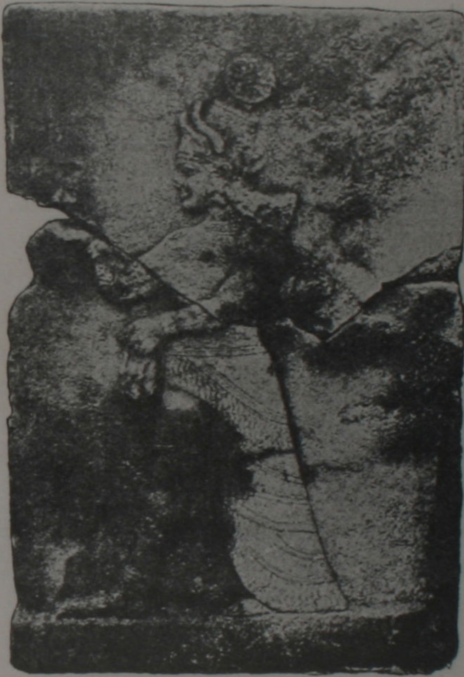
FIG. 9.—DEITY WEARING A HORNED HEADDRESS.

of about a metre, consist as in Zenjirli of rough unhewn blocks, and it may be concluded that here also the upper parts of the walls were of unbaked