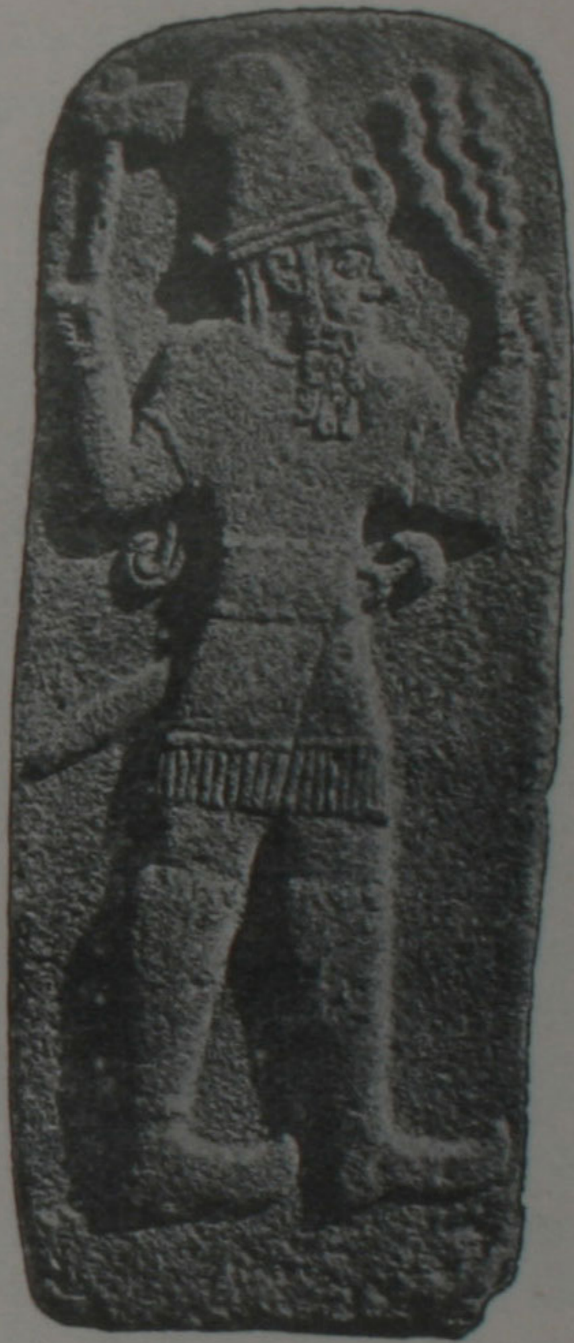
FIG. 6.—STATUE OF THE STORM-GOD TESHUP.

brandishing in the other a hammer, the symbol of fertility ( cf. Thor with his hammer Miölnir). A god Sanda appears to have been worshipped among others in Cilicia; in Mitani the goddess Shaushkas, corresponding to the Babylonian Istar, was honoured side by side with Teshup, and perhaps also a god Shimigi. The so-called Van inscriptions ( see p. 31) give us a large number of divine names, but we have as yet no information regarding the nature of most of these deities. The tribe of the Van inscriptions had probably adopted the god Teshup from an earlier tribe of kindred race, for though the name occurs frequently in the inscriptions, the highest place is occupied by the god Khaldis, whose name has hardly been transferred to a single inscrip-