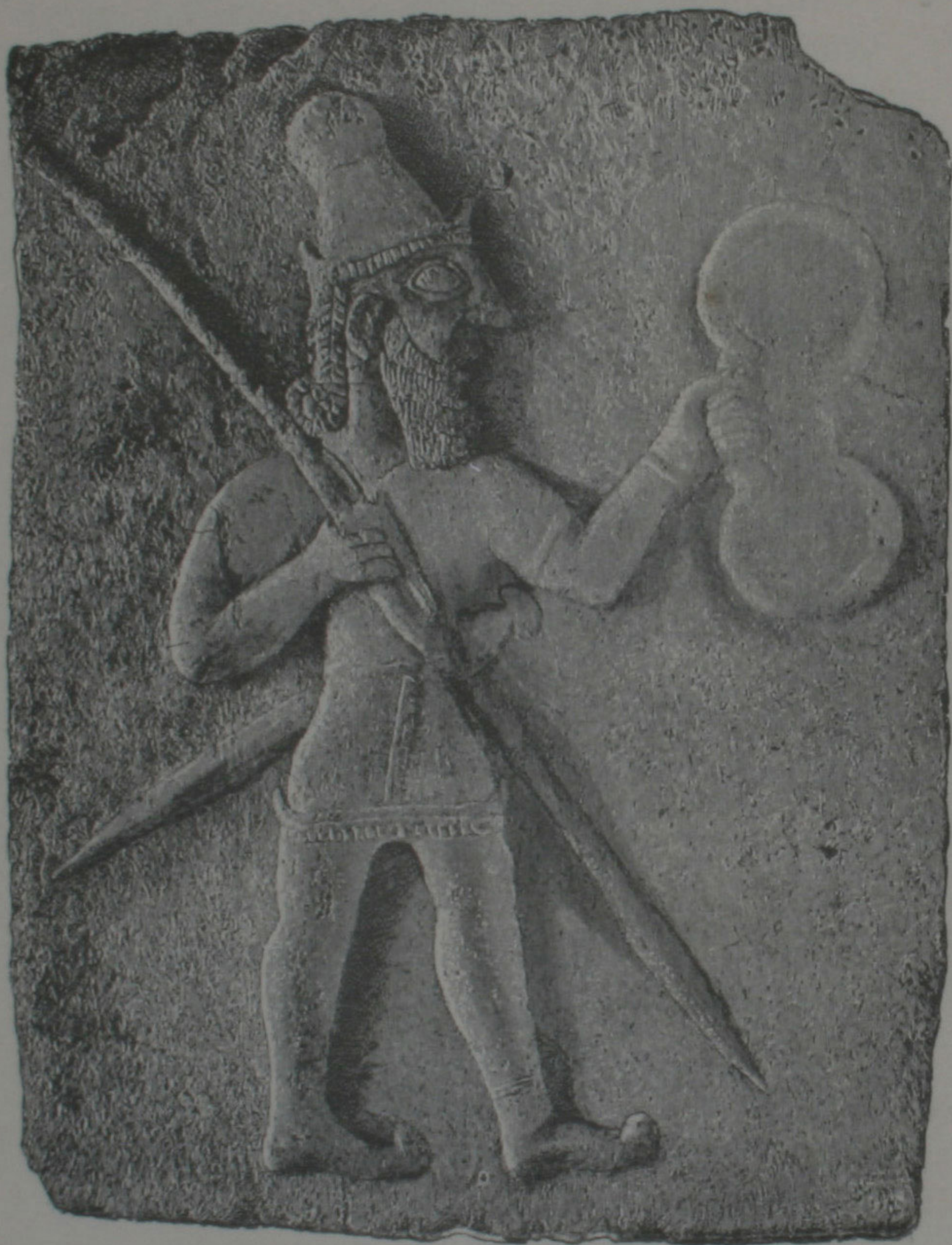
FIG. 3.—HITTITE WARRIOR, FROM THE CASTLE GATEWAY IN ZENJIRLI ( cf. p. 47).