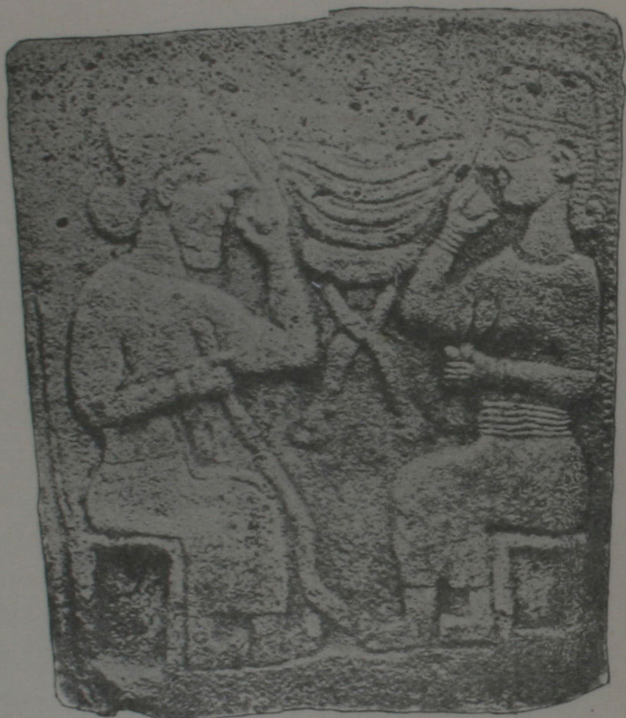
FIG. 4.—HITTITE REPRESENTATION OF A MEAL. Relief from the gate sculptures of Zenjirli ( cf. p. 47).

a veil ( see Figs. 4 and 5). This is fastened in some way to the headdress and falls down to the feet, covering the whole of the back.