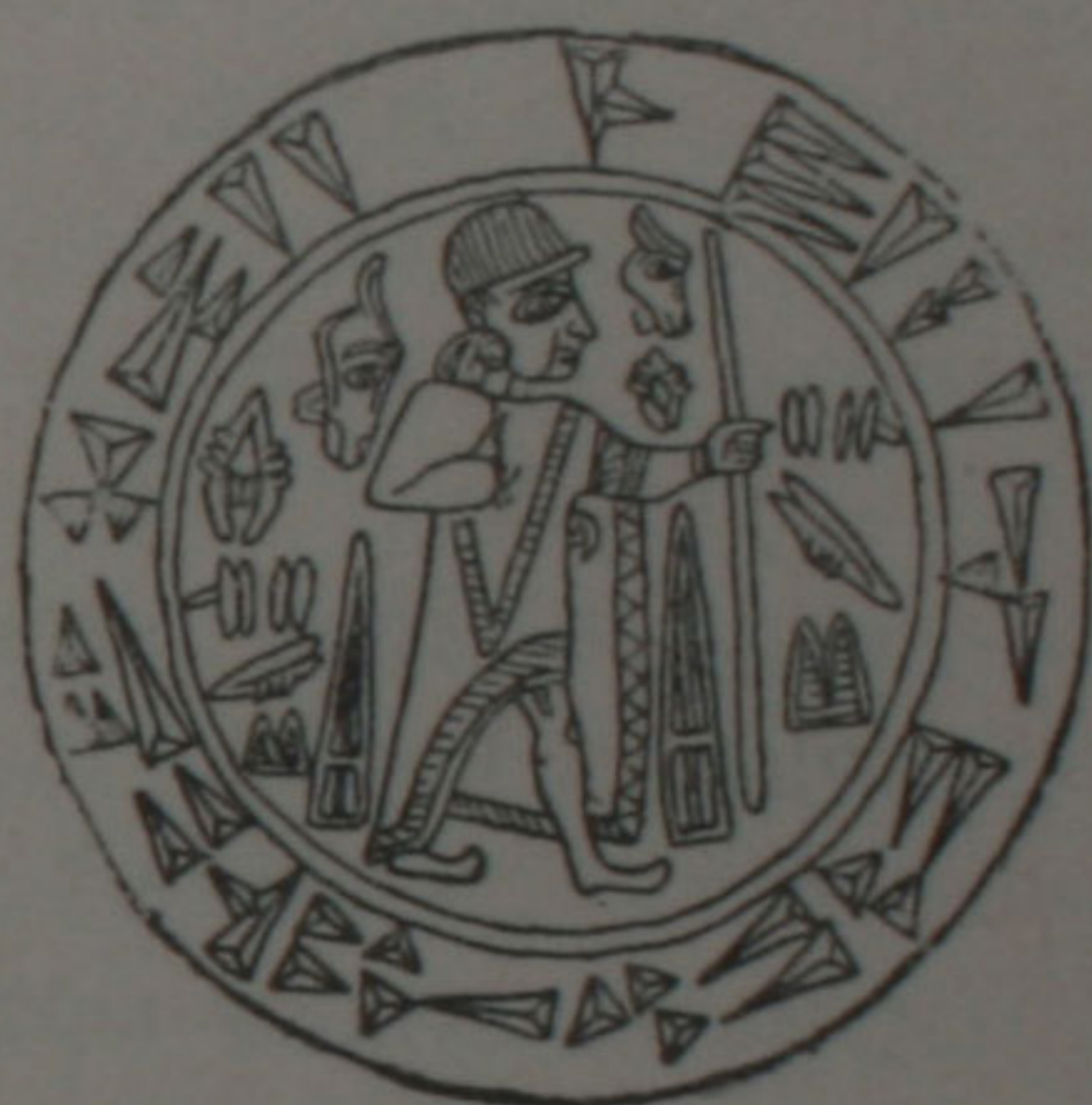
FIG. 2.—INSCRIPTION OF TARKUDIMME.

or following it belongs; other characters may stand for a syllable, and others again perhaps for a single sound. The whole system is rendered extremely intricate by this complexity of the functions of the signs, as the same word may be written in many different ways. In the case of the analogous systems of the Egyptians and Assyrians, the decipherer's task was simplified by the existence of inscriptions the wording of which was identical, though repeated in several different characters and languages — one of them either known, or at least more easily unriddled. For the Hittite script it is true that we have a similar source of information, naturally much discussed, in the bilingual inscription of "Tarkudimme" (Fig. 2), but it is unfortunately too short and too full of difficulties in itself to be of much practical use. The object in question is a hollow hemisphere of silver once forming the boss of a dagger handle, and intended to be used as a seal. The figure and characters are engraved on the convex surface. Round it runs a cuneiform inscription signifying: "Tarkudimme,