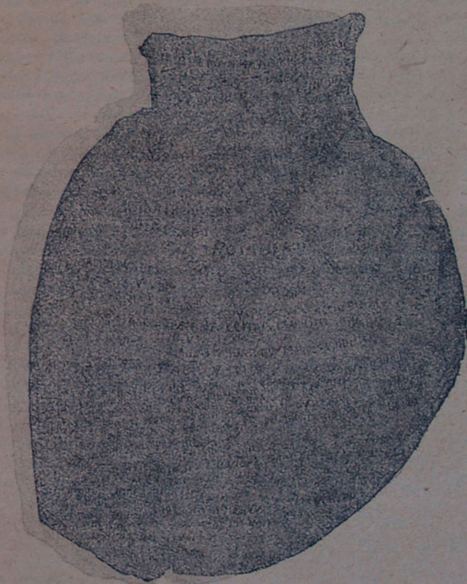
Facsimile of the reverse of the Sherd of Amenartas.