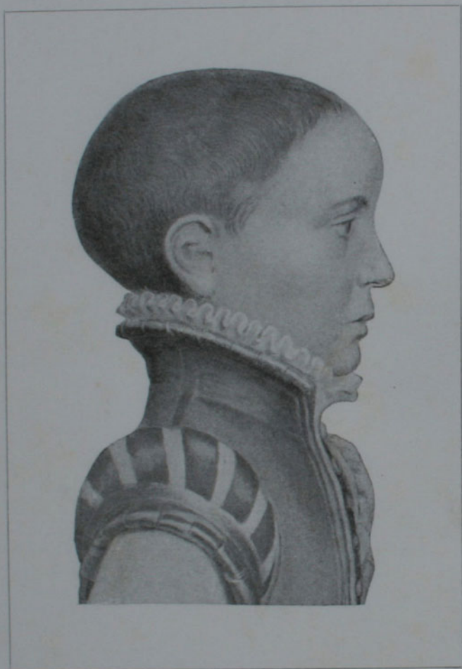
FRANCIS BACON AT 9 YEARS OF AGE.