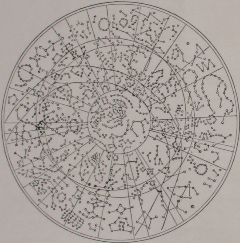
A CHINESE STAR MAP.

Reproduced from Monthly Notices 69. Pl. 18.